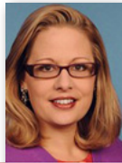
Martha McSally (R)